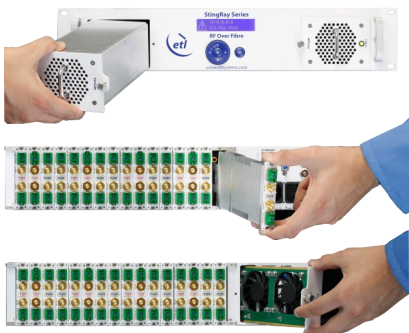
Indoor chassis showing hot-swap power supply modules , fibre modules and fans

10MHz Inject from an external source chassis option