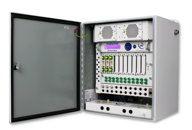
Outdoor Unit (ODU)

Local control & monitoring via front panel push buttons & display